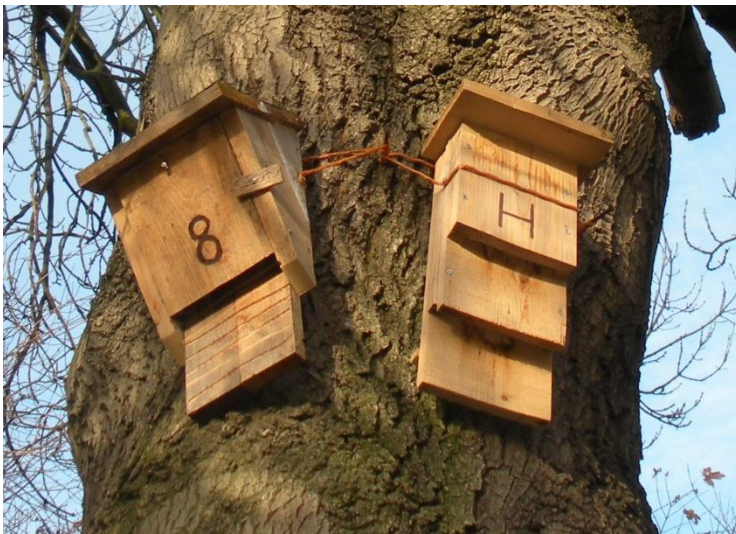
A Gwent box (left) and a Kent box on the same tree.