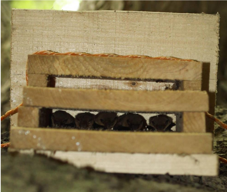
Five Common Pipistrelles in the back slot of a Kent box, seen from below.

there was no significant difference in the number of occasions a single bat was found in the back slot and the front slot. Individual bats seemed to show no preference.