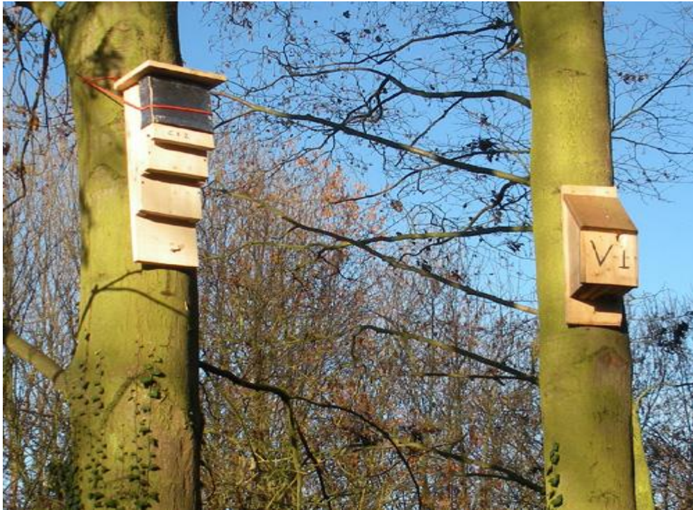
A Super-Kent box with anti-woodpecker metal covering (left) and a CJM box (right)

box, but with three rather than two slots. Ten of these were installed with various arrangements of 15 mm., 20 mm. and 25 mm. slots. Some of the Kent and Super-Kent boxes had a metal covering over the front to prevent woodpecker damage. Two further boxes were of the CJM type, designed by Colin Morris of the Vincent Wildlife Trust 7 . These have three or four slots, of various widths, arranged at 90° to the back of the box. The final four (MOT) boxes were of an elongated cuboidal shape and were designed by Martin O'Connor.