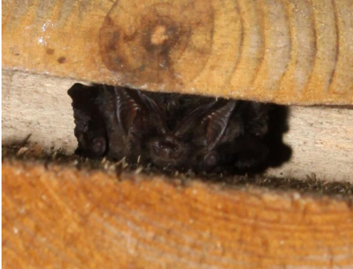
A Barbastelle in a Kent box.

The regular monitoring of these boxes has provided a great deal of useful information. We have not heard of another bat box project which involves regular checks of the boxes in winter, and such checks at Priory CP have established that some use of the boxes continues throughout the year, with peaks of activity in spring and autumn. The preferential selection of the wider back slots in summer, and of the narrower front slots in winter seems to be related to the size of the group of bats found together. The boxes are not used as maternity roosts, but are used by groups of up to nine bats in spring and autumn as well as by smaller numbers in summer and winter. At this site, use of the boxes is dominated by Common Pipistrelles, with occasional use by at least one other species. The Bat Group would be interested to hear of other sites in the county with numbers of bat boxes where monitoring is possible but not carried out at present.